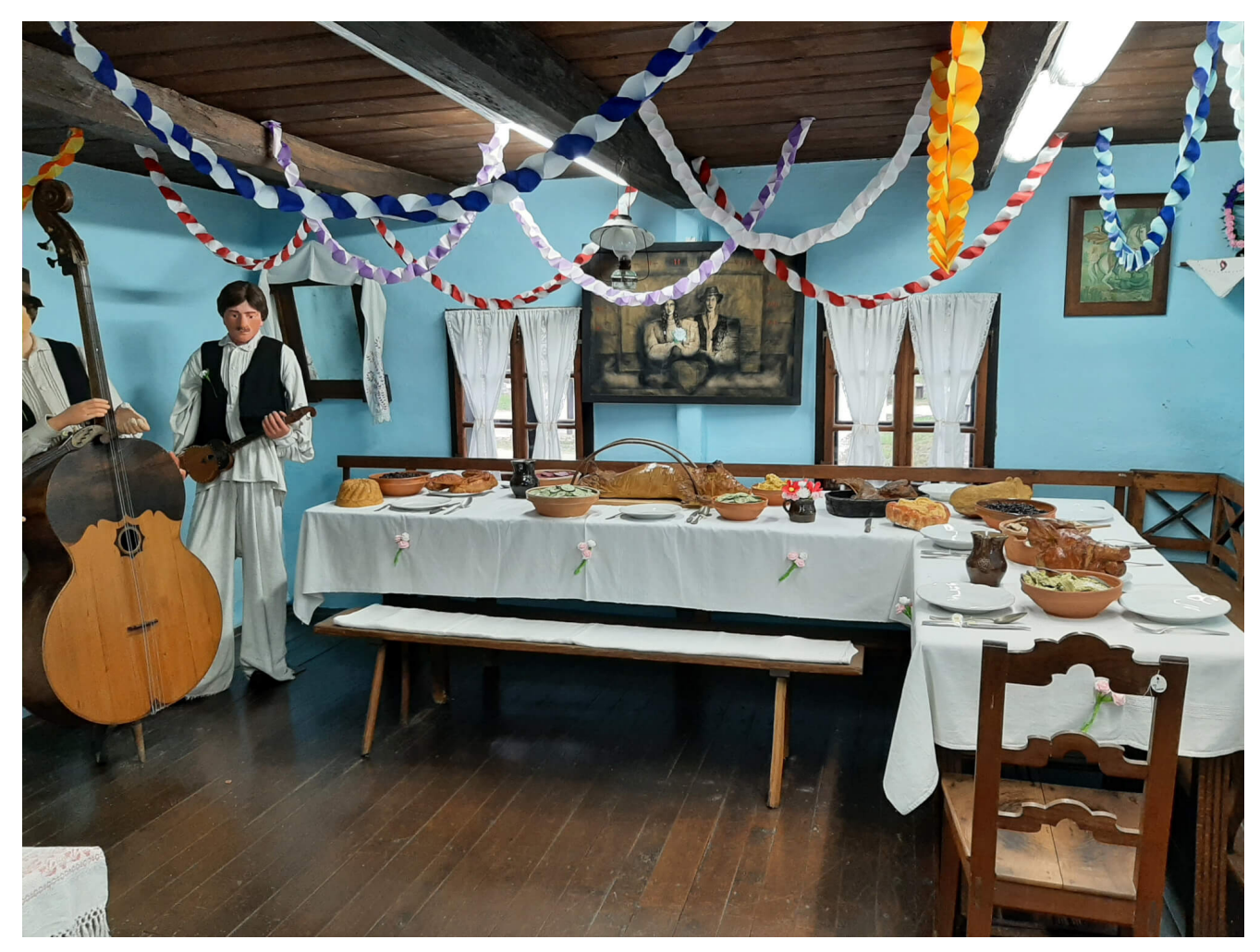
And what's next?